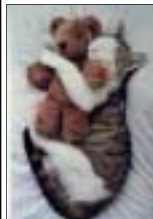
Find a friend and don't let go