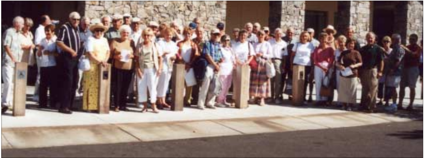
The Garden Club and the Wine Tasting Group with friends and guests at The COPIA Center in Napa.

Time Value Mail Please deliver by September 30