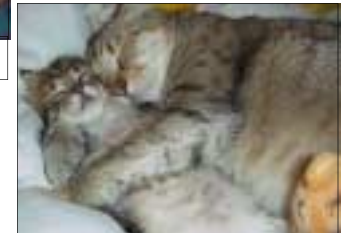
Curl up with Mommy