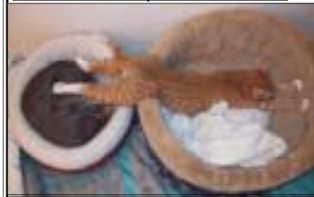
Work hard then crash