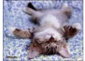
Force your eyes closed and dream nice dreams