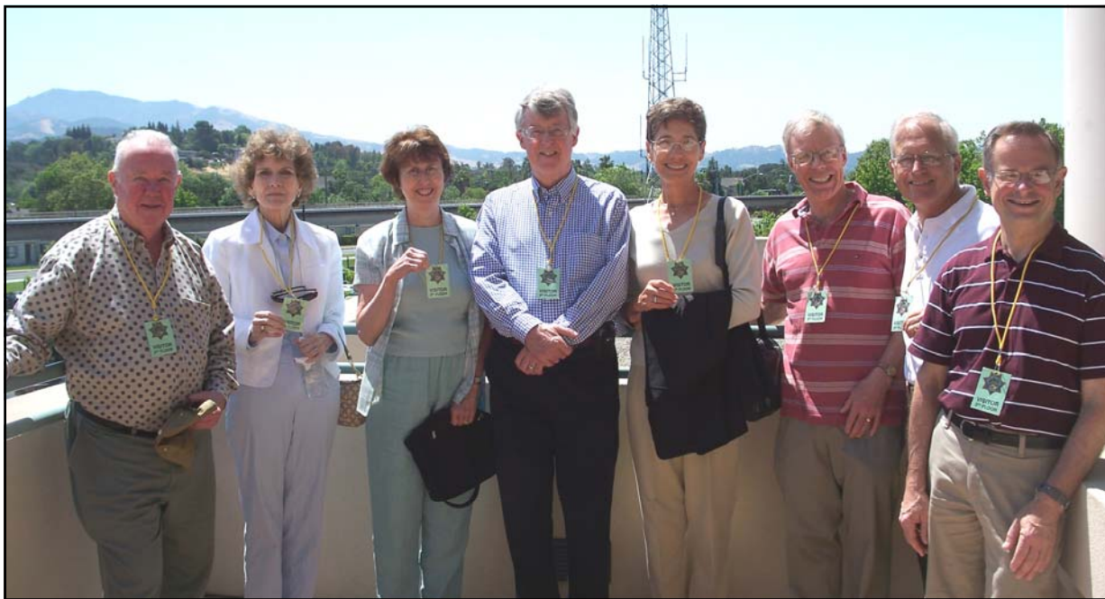
Explore and Dine Group at Concord Police Department