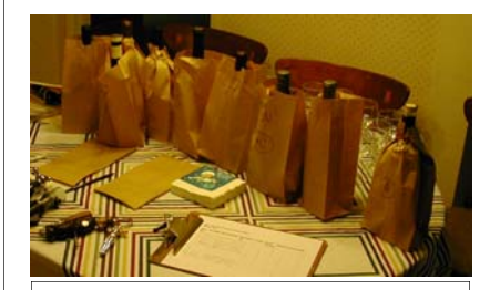
Grab your glass, score sheet and let's have some fun!