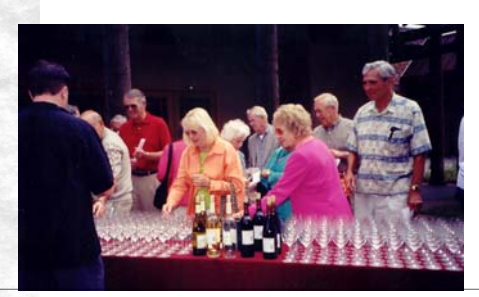
Eager wine tasters, ready to get started.