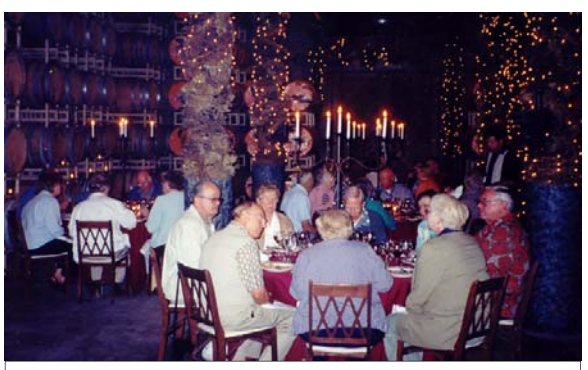
Great food! Great company! Beautiful setting!