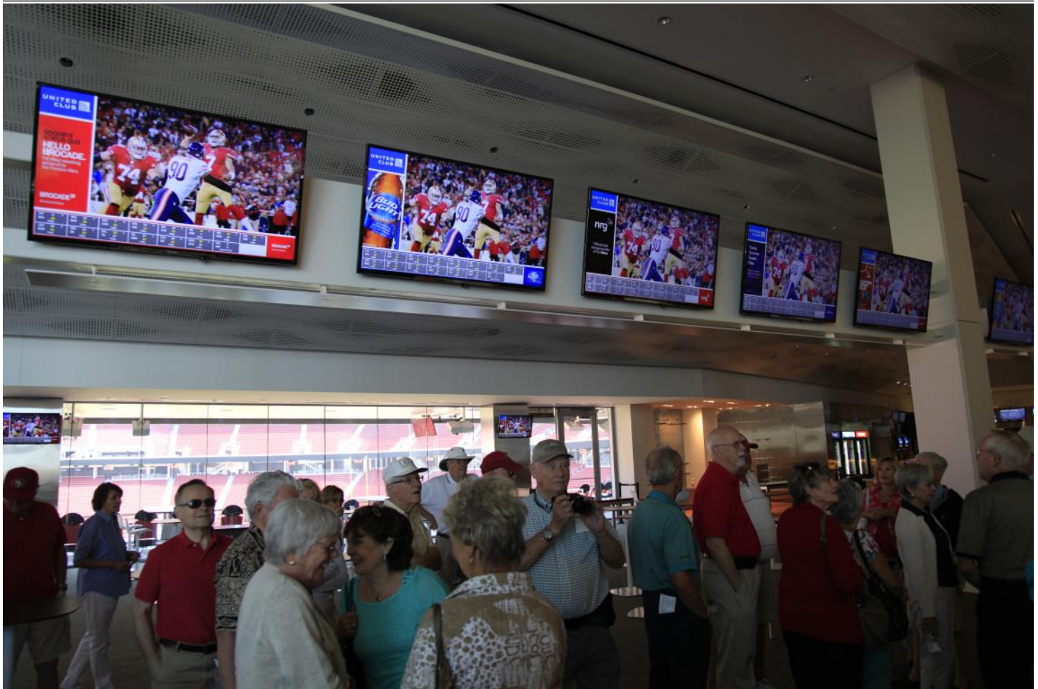
Tour of Levi's Stadium inside the United Club