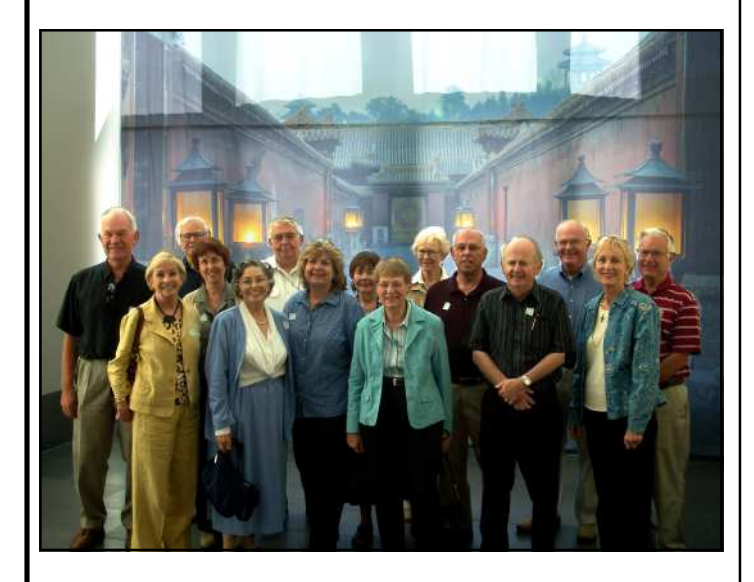
Explore & Dine Group At the Asian Art Museum in San Francisco