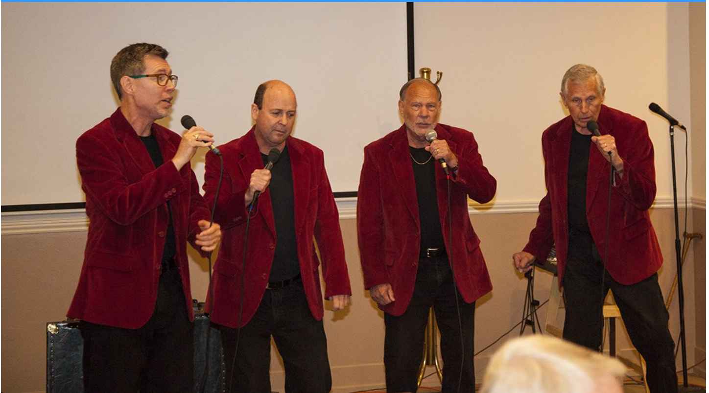
HouseBlend, an a cappella male quartet from Concord and Walnut Creek, entertained the SIR membership and their guests at the May 2015 Ladies Day Luncheon Gala