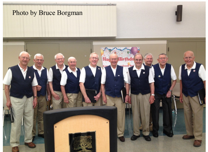
SongSirs singing at the Walnut Creek Senior Center

A number of our SongSirs were off traveling so we had a slightly smaller group, but the remaining faithful members sang with no less enthusiasm. We will be working on a summer repertoire. Again, we practice at Walnut Creek Presbyterian Church every first and third Wednesday and any of you closet or shower crooners are invited to join us for a fun time.