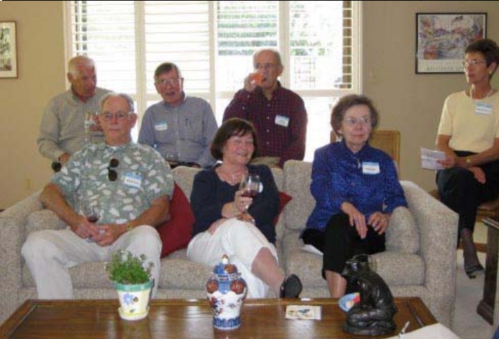
Branch 146 wine tasters readying to rate the wines of the day.