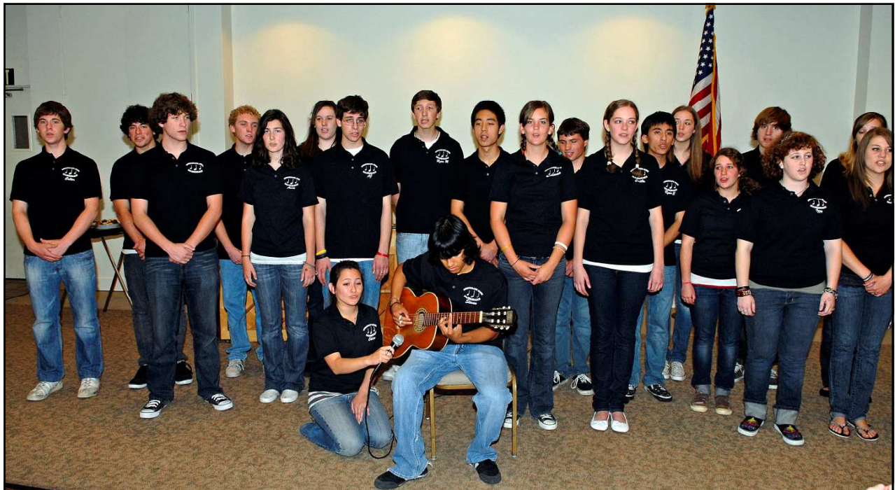
The Northgate Madrigals Singers