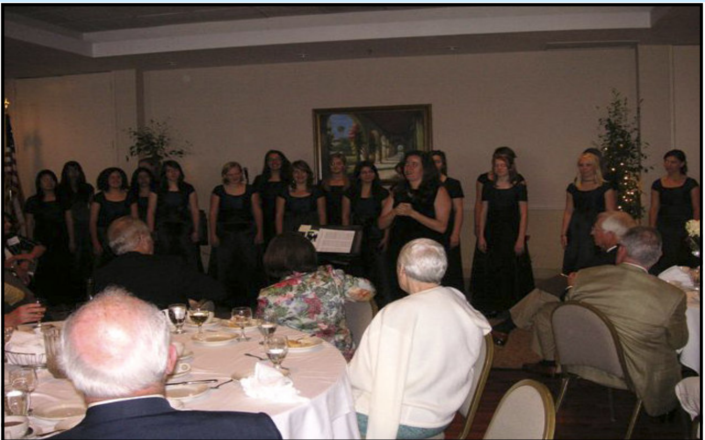
Clayton Valley Women's Ensemble Choir

Time Value Mail Please deliver as soon as possible.