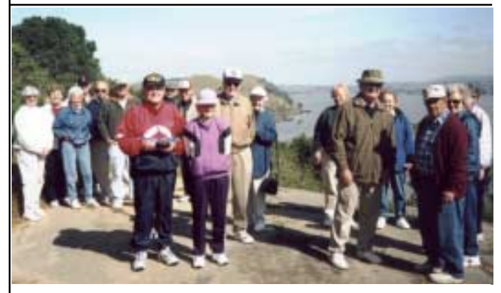
SIR walking group stops for a group picture along the Carquinez Scenic Way

July 27– Walk the Shoreline Trail at Crown Memorial State Park (Alameda) & view restored Victorians on Grand Street. Meet at Orinda Village Safeway for carpools.