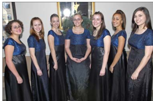
The Clayton Valley High School Women's Ensemble. They were Great!