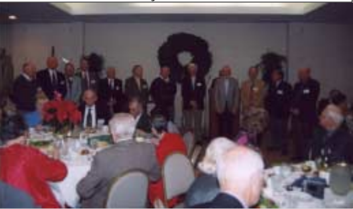
SIR Branch 146 installs its officers for 2004