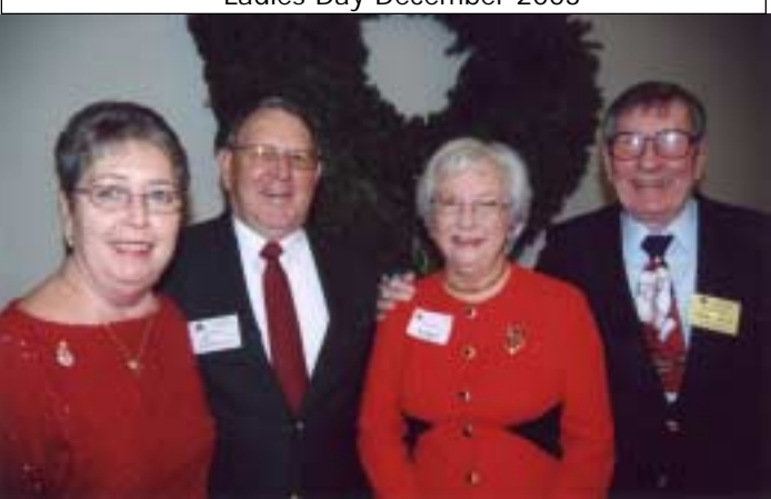
Ladies Day December 2003

October 3-10, 2004 <u>National Parks of the Southwest</u>. Includes r/t air SF to Las Vegas and motor coach throughout tour. Visit Grand Canyon, Bryce and Zion National Parks as well as Lake Powell cruise, Sedona pink jeep tour, wagon ride and steak fry in Mesquite and sights along the way. Includes 7 breakfasts and 6 dinners as well as all admissions. Cost $1450 p/p d/o. Contact Charlie Kiser , 274-1575