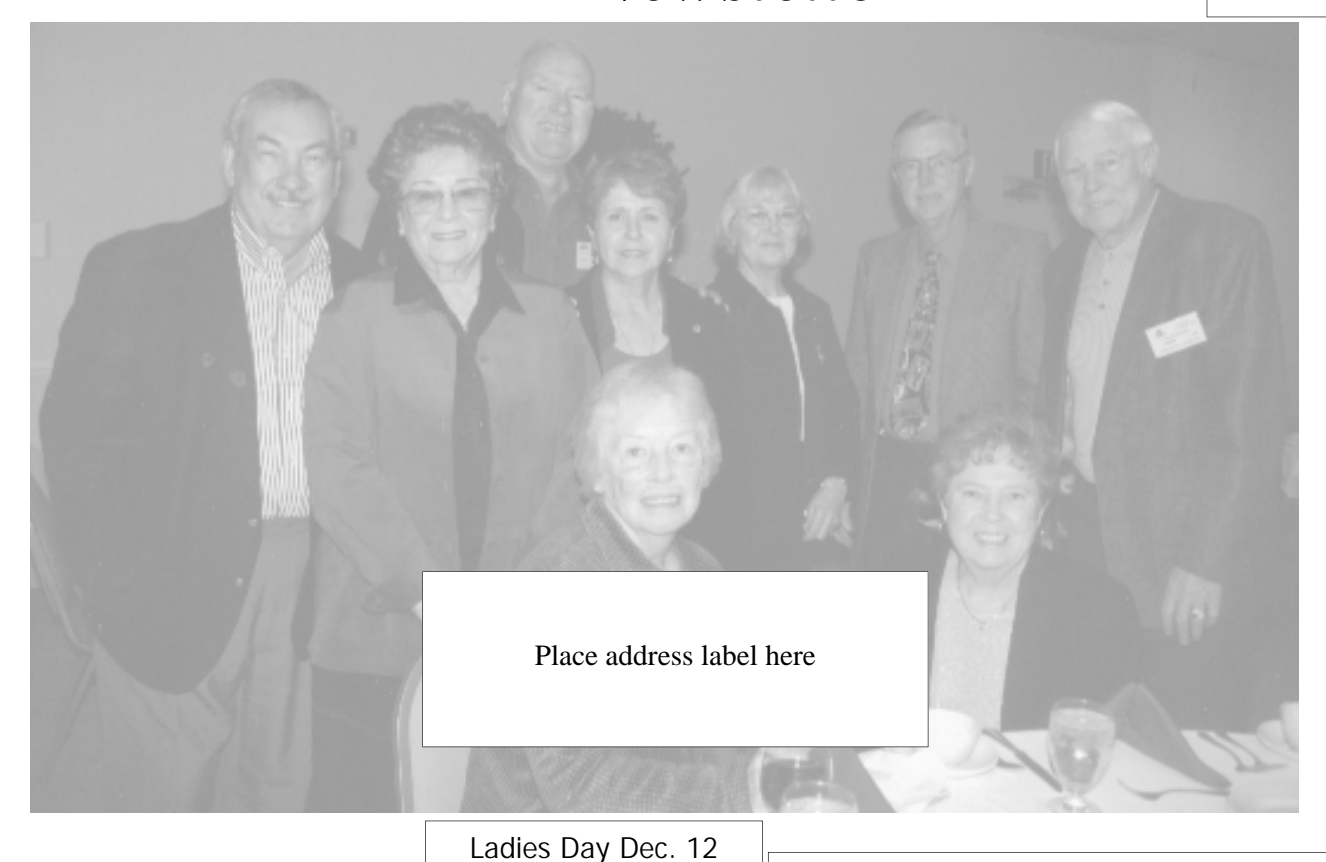
Ladies Day December 12, 2003