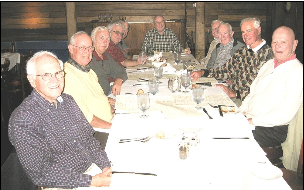
ROMEIO Group at the Walnut Creek Yacht Club