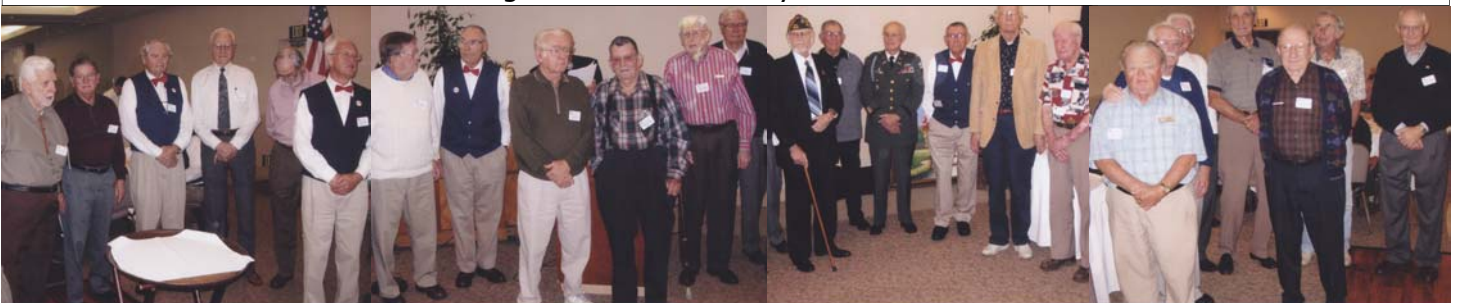
Pictured above are 25 of the founding members of Sons in Retirement Branch 146, honored at our November Luncheon