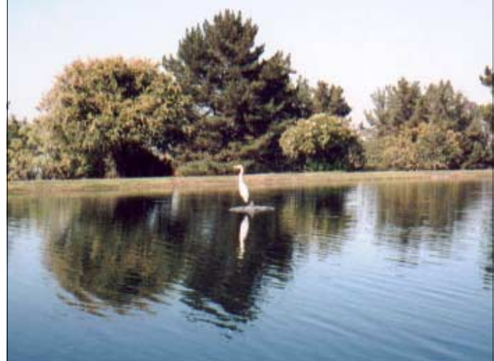
An egret in the lake on the 5th at Boundary looks up to admire a nice approach shot by Sir John Denham.