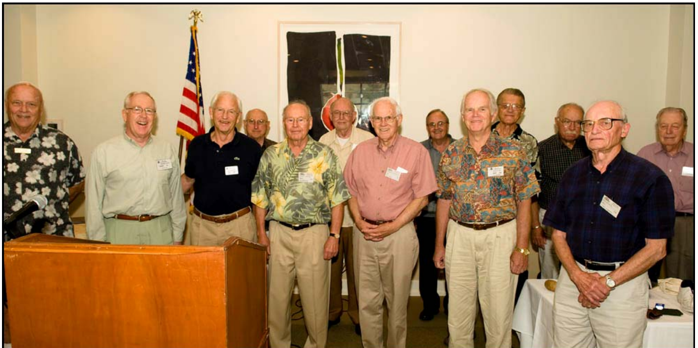
Branch 146 Song Sirs

Time Value Mail Please deliver as soon as possible.