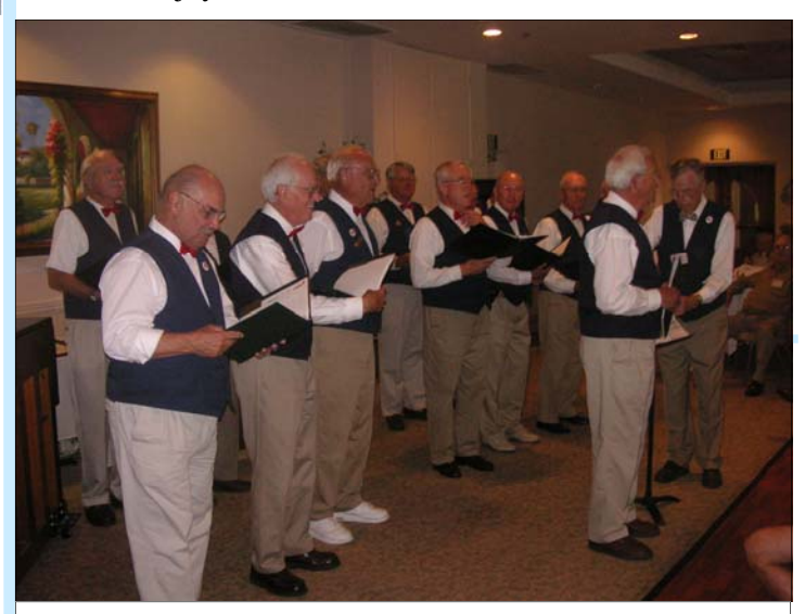
The Song Sirs celebrate Independence Day.

Practices are scheduled at the regular time and place until that date. As I write this on July 12, I note that summer has finally arrived and not a moment too soon. Time to kick back and enjoy.