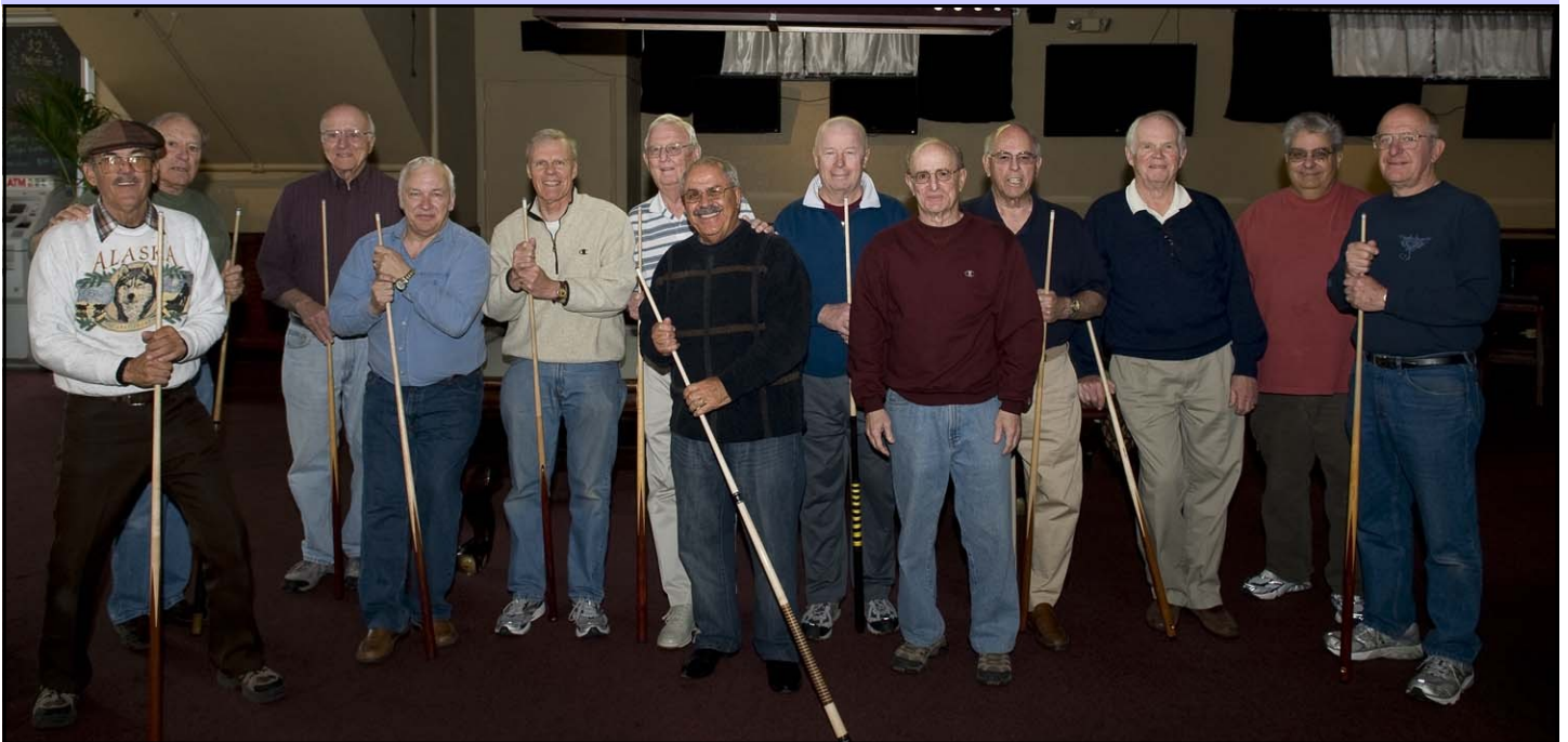
Sirs Area 2 Pool Group

Enclosed is my check for $ _____ to cover the cost of _____ one pound certificates.