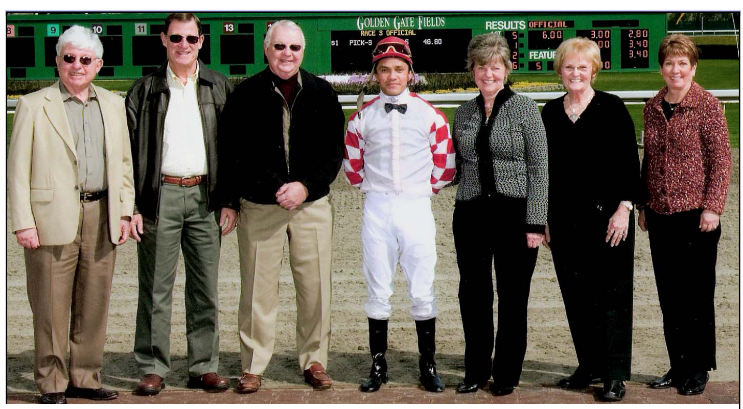
Branch 146 Day at the Races

Time Value Mail Please deliver as soon as possible.