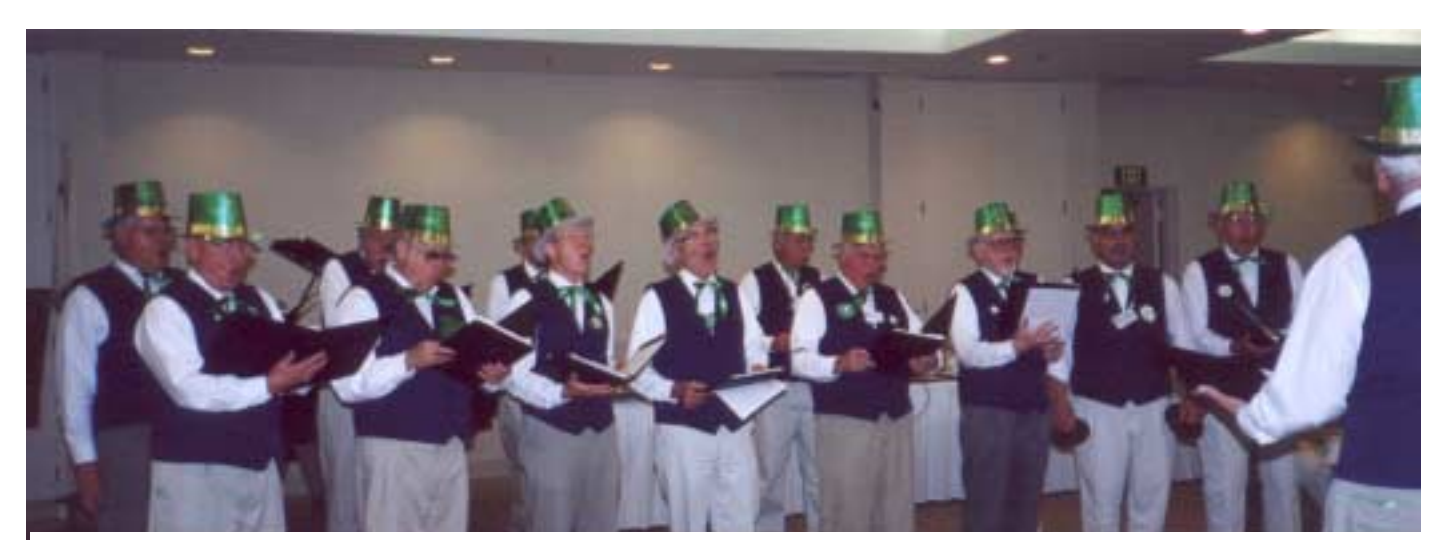
The SongSirs entertain the members at the March Luncheon